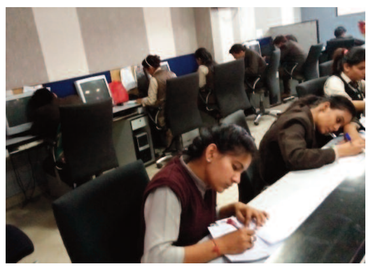
Students of GSVSIJMC going for placement interview