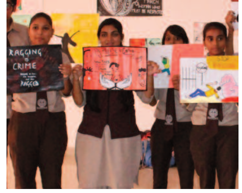
Students making posters at SIJMC during competition