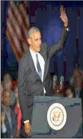
Obama giving his Farewell Speech.