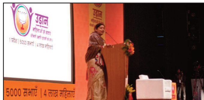
Smriti Irani addressing Women in SVSU

Subhartipuram: Union Minister Smt. Smriti Irani addressed the female students of Swami Vivekanand Subharti University at its Maangalya convention center on 6 th January 2017. She started the program "Udaan" in the premises of Subharti University and connected with 403 women of different constituencies through Video Conferencing. During the event she addressed the gathering and gave answers of several questions raised by the people. She urged the women