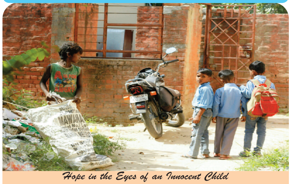
Hope in the Eyes of an Innocent Child