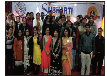
Winners of Uni-Mentors Fest 2017