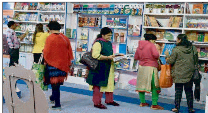
People exploring the World Book Fair

The World Book Fair 2017 which was held from January 7-15 at Pragati Maidan in New Delhi attracted greater footfall this year as people from different states attended it. The 44th edition of the book fair was inaugurated by Minister of State for Human Resource Development (Higher Education) Mahendra Nath Pandey.