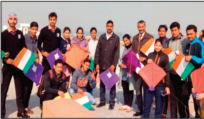
Students & Faculty members participating in Kite Flying